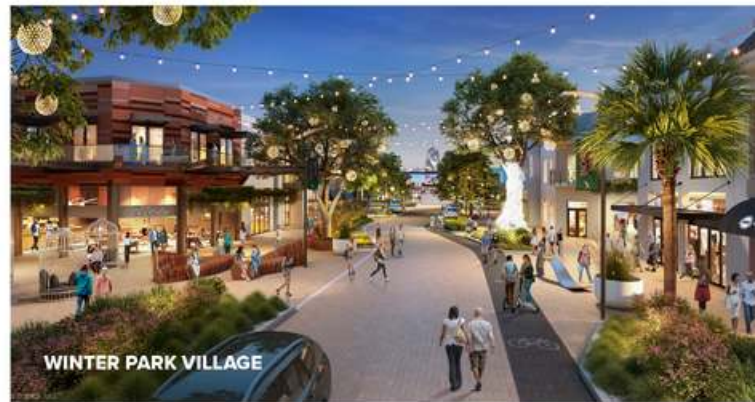
WINTER PARK VILLAGE